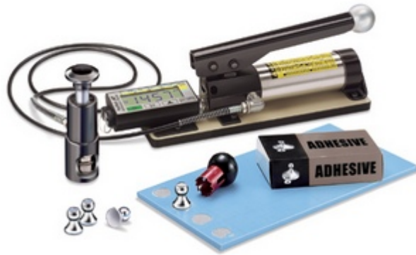
Large, easy-to-read LCD